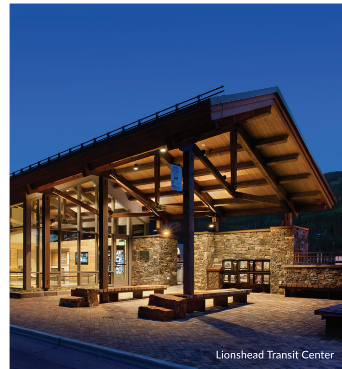
Lionshead Transit Center