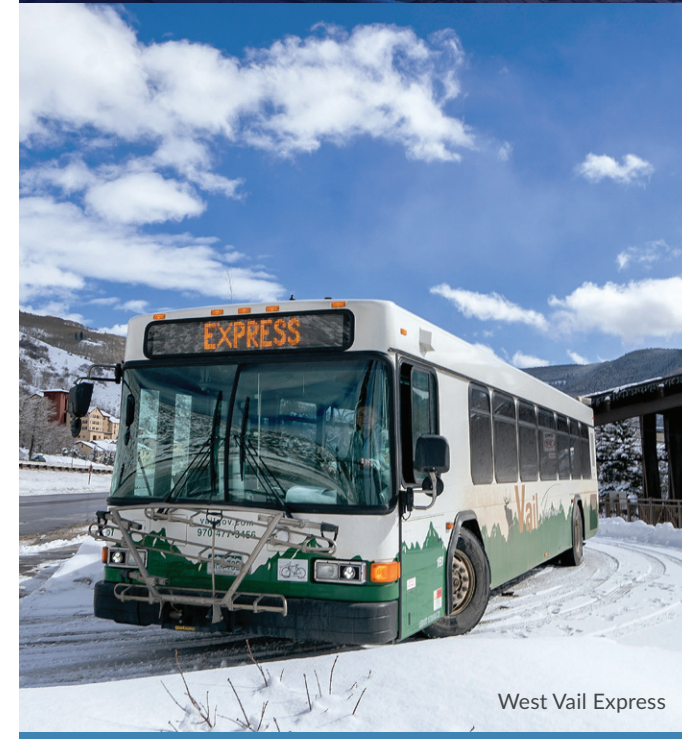
West Vail Express

Vail Transit Real Time Information ride.vail.gov